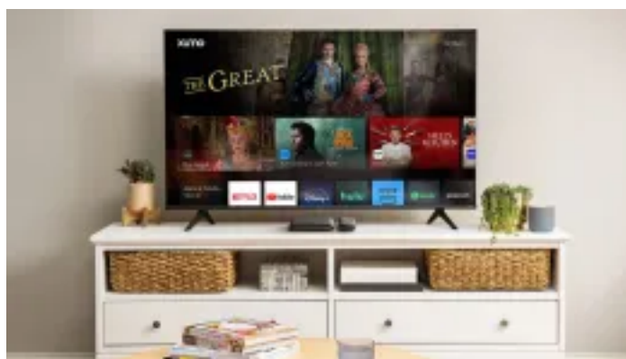
XUMO Charter and Comcast Officially Roll Out Xumo Streaming Box