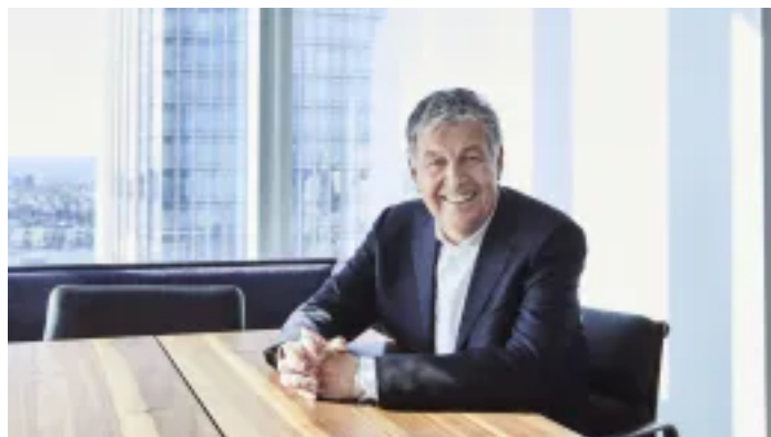
INTERNATIONAL Warner Bros. Discovery Unveils New International Leadership Team