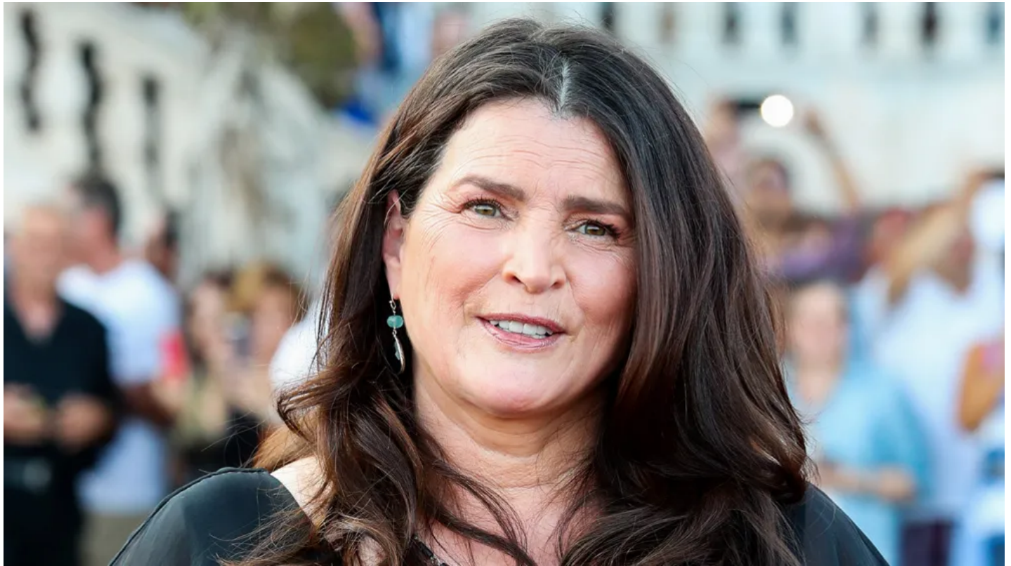
Julia Ormond.