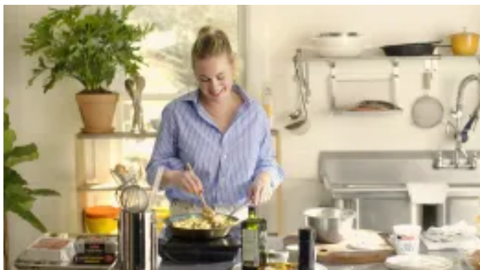
PODCASTS Chef Alison Roman Launches New Podcast 'Solicited Advice'