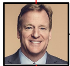
Rodger Goodell, NFL Commissioner