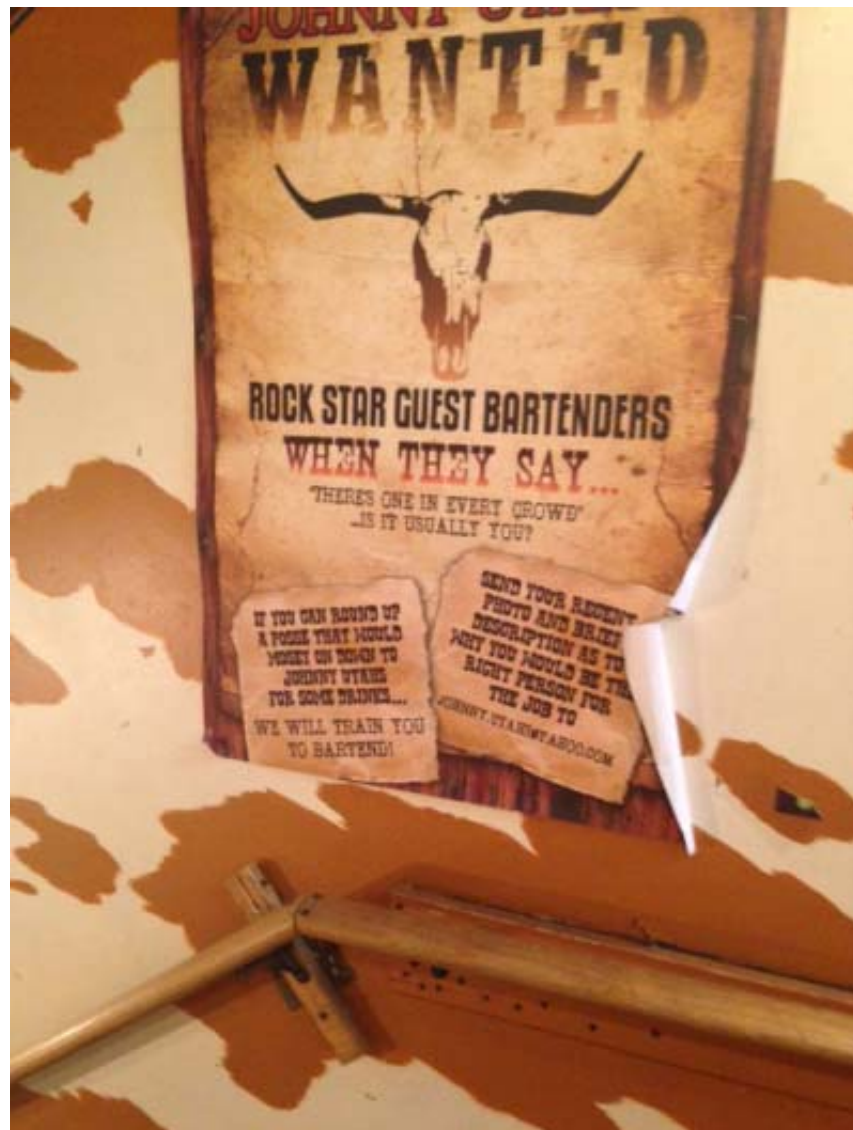
This help wanted posted decorates the entrance into the cellar that is Johnny Utah's.