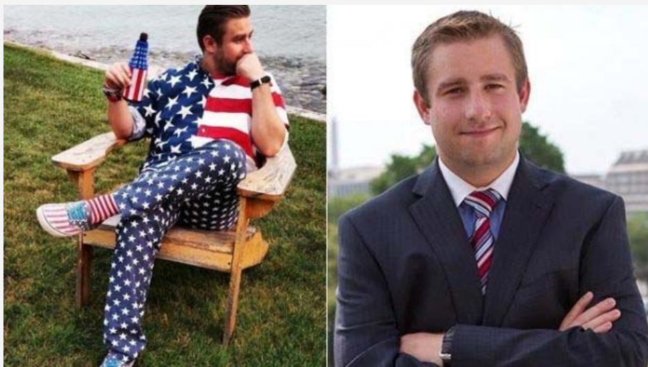
Rich was fiercely patriotic, say family members.